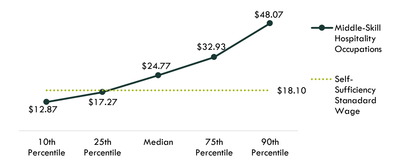
Exhibit 4: Average Hourly Earnings for Middle-Skill Hospitality Occupations in LA/OC

On average, the entry-level earnings for the occupations in this report are $17.27; this is below the self-sufficiency standard wage estimate for one single adult in Los Angeles County ($18.10). Exhibit 4 shows the average wages for the occupations in this report, from entry-level to experienced workers.