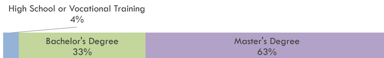
Exhibit 17: Percentage of job postings seeking each level of education for substance abuse treatment occupations in the Inland Empire/Desert Region, Oct 2017 – Sep 2018