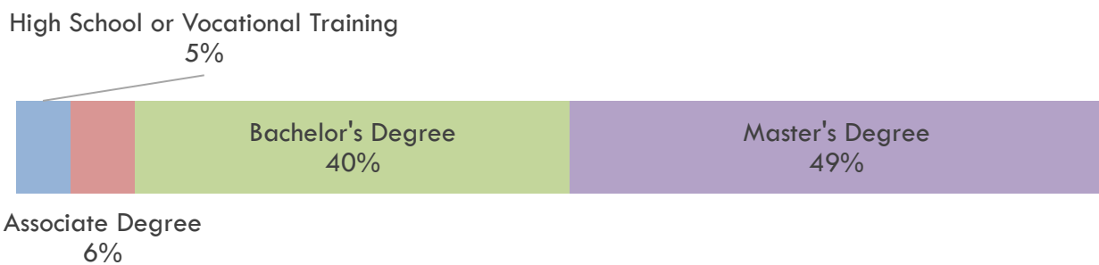
Exhibit 24: Percentage of job postings seeking each level of education for military social work occupations in the Inland Empire/Desert Region, Oct 2017 – Sep 2018