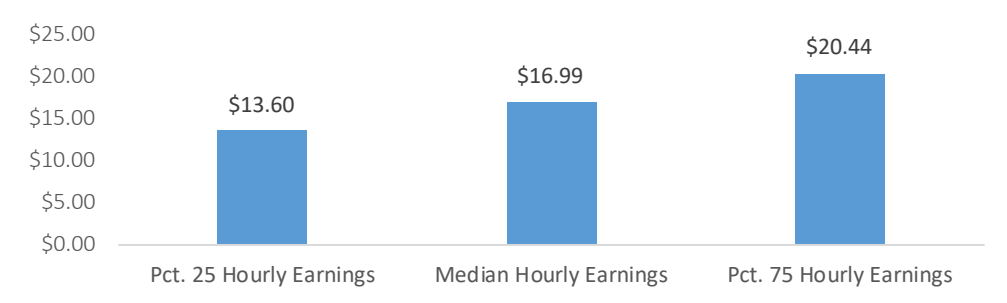
Hourly wages for SOC 51-7011 Cabinetmaker and Bench Carpenters, 6-county Sacramento region

Wages are low for the occupation, just $17 per hour at the median level. The occupation could be considered an entry point to a construction pathway that could include multiple avenues toward higher levels of training and earnings. The living wage for a one adult, one-child household in Sacramento County is $25.90.2