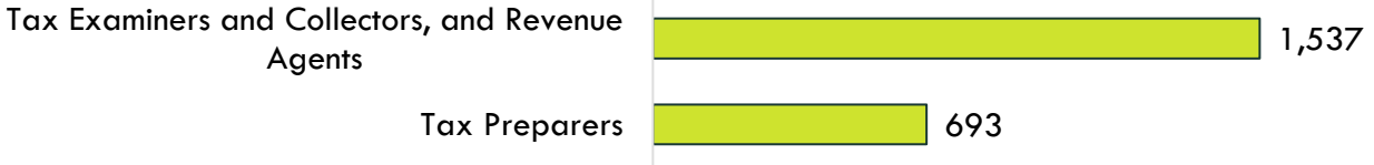
Exhibit 5: Job postings by occupation (last 12 months)