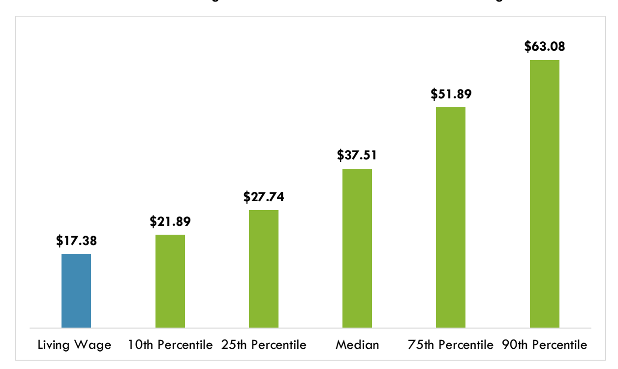
Exhibit 3b - Earnings for Tax Studies in the South Central Coast Region

Source: Family Needs Calculator (Living wage is based on Single Adult households with no children); Economic Modeling Specialists International (EMSI)