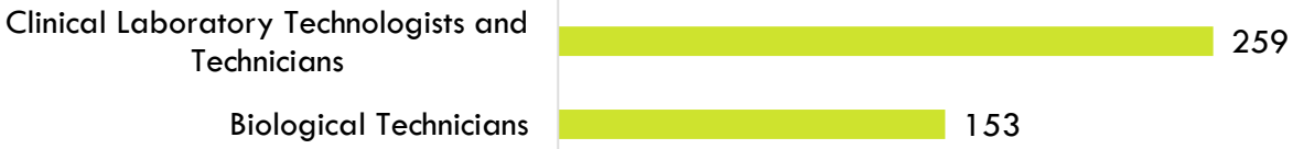
Exhibit 5: Job postings by occupation (last 12 months)