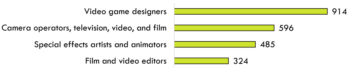
Exhibit 6: Job postings by occupation (last 12 months), Los Angeles and Orange counties

Job postings were also analyzed for the most common job titles, skills, and employers associated with the target occupations in this report (Exhibit 7).