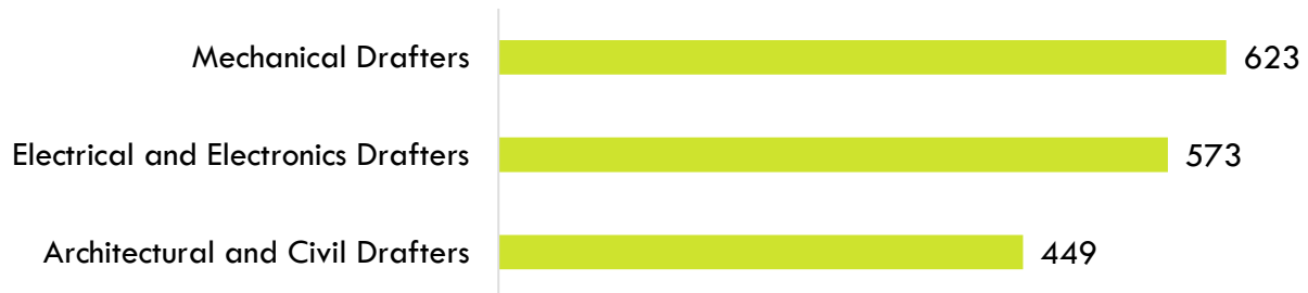
Exhibit 5: Job postings by occupation (last 12 months)

There were 1,645 online job postings related to drafters listed in the past 12 months. Exhibit 5 displays the number of job postings by occupation. The majority of job postings (38%) were for mechanical drafters , followed by electrical and electronics drafters (35%) and architectural and civil drafters (27%). The highest number of job postings were for drafters, electrical designers, mechanical designers, civil designers, and CAD drafters. The top skills were computer-aided design software such as AutoCAD, Autodesk Revit, and SolidWorks, followed by construction, electrical engineering, and architectural drawing. The top three employers, by number of job postings, in the region were all staffing companies: Actalent, Jobot, and Randstad.