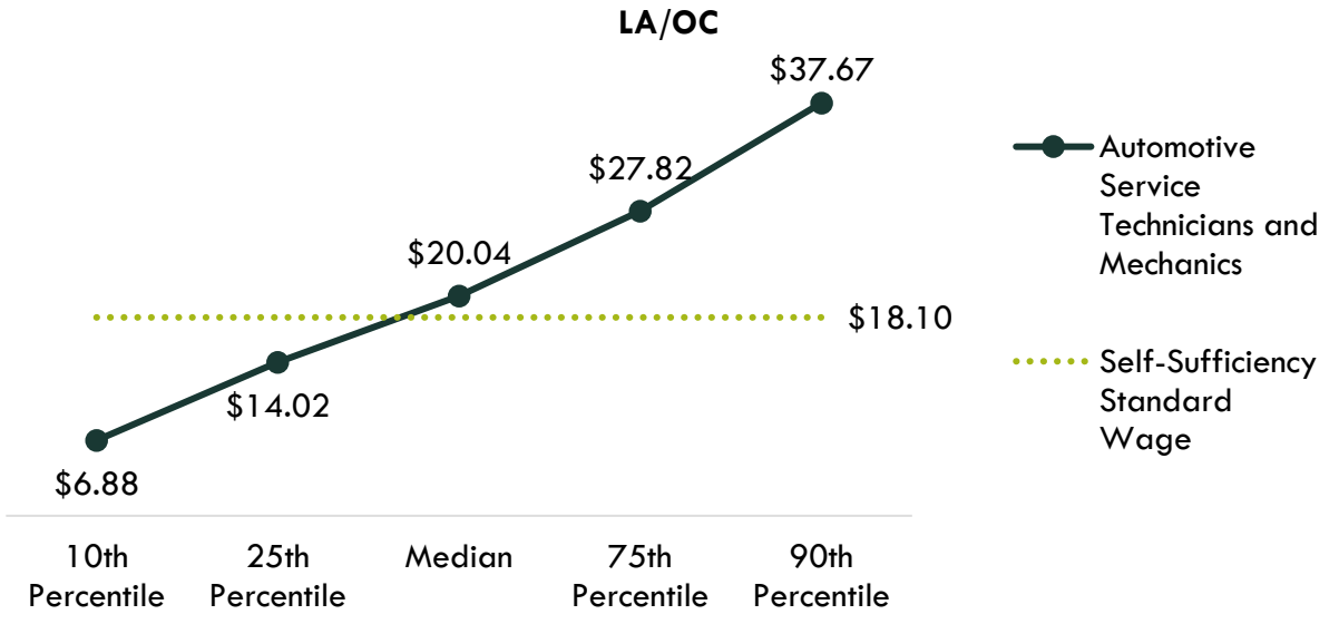
Exhibit 4: Average Hourly Earnings for Automotive Service Technicians and Mechanics in

On average, the entry-level earnings for the occupations in this report are $14.02; this is below the living wage for one single adult in Los Angeles County ($18.10). Exhibit 4 shows the average wage for the occupations in this report, from entry-level to experienced workers.