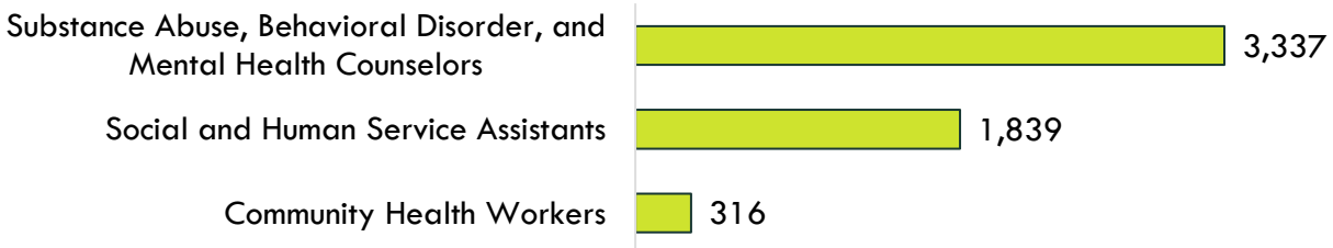
Exhibit 6: Job postings by occupation (last 12 months)

by number of job postings, in the region were Foresight Mental Health, Telecare Corporation, and Elevance Health.