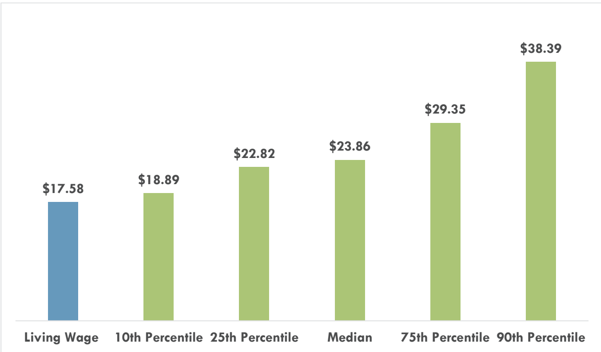
Exhibit 3b – Earnings for Paramedic in the South Central Coast Region